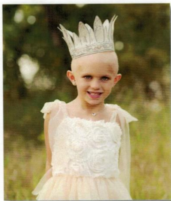
HOPE now and for the future